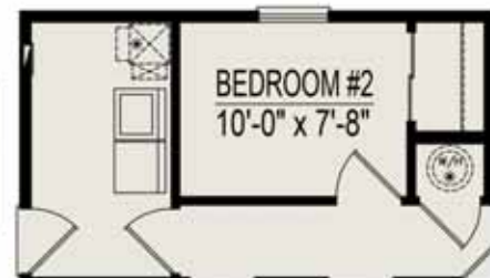
Crawl Space Plan