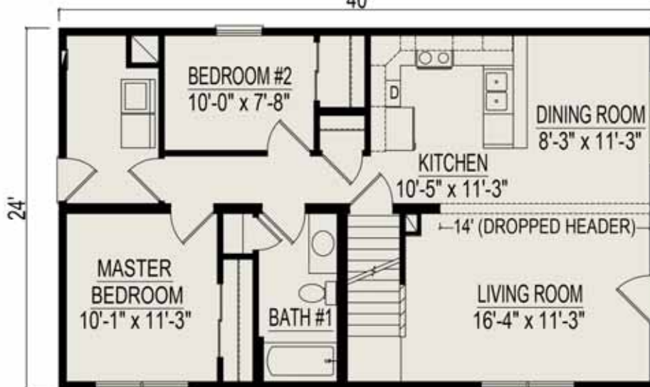
1st Floor Basement Plan